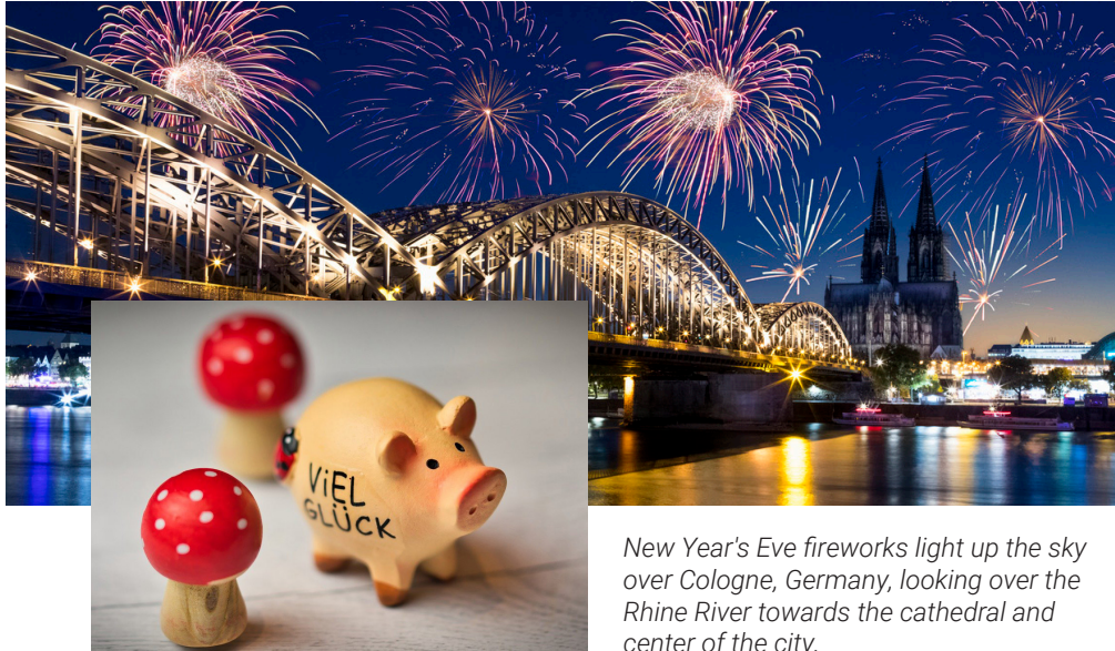
New Year's Eve fireworks light up the sky over Cologne, Germany, looking over the Rhine River towards the cathedral and center of the city.